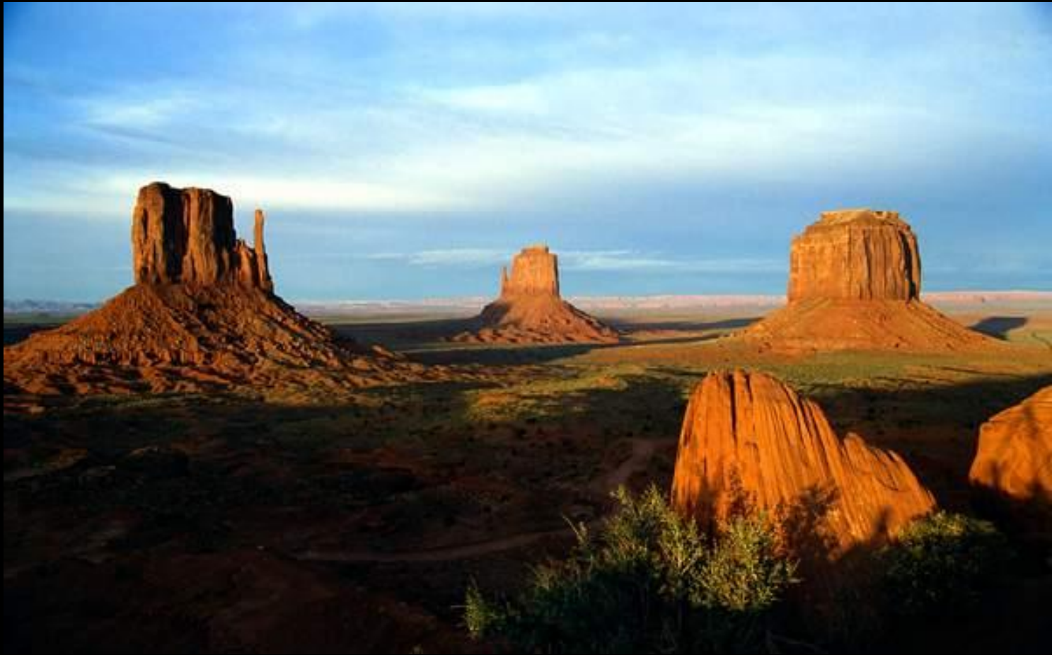
Monument Valley at sunset