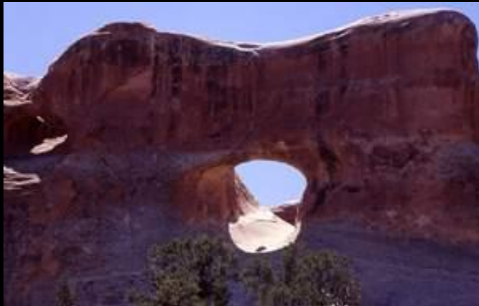
A hole is formed by erosion