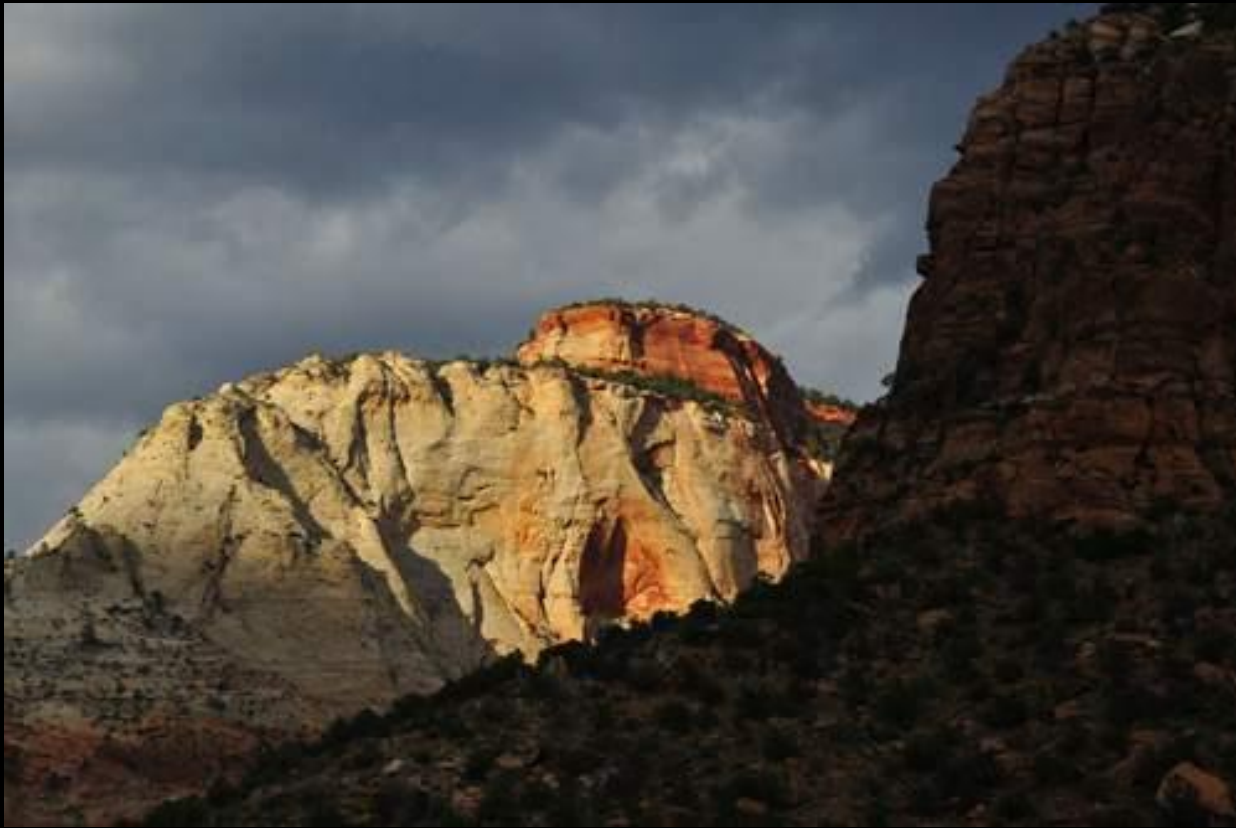
The colorful Navajo sandstone formation