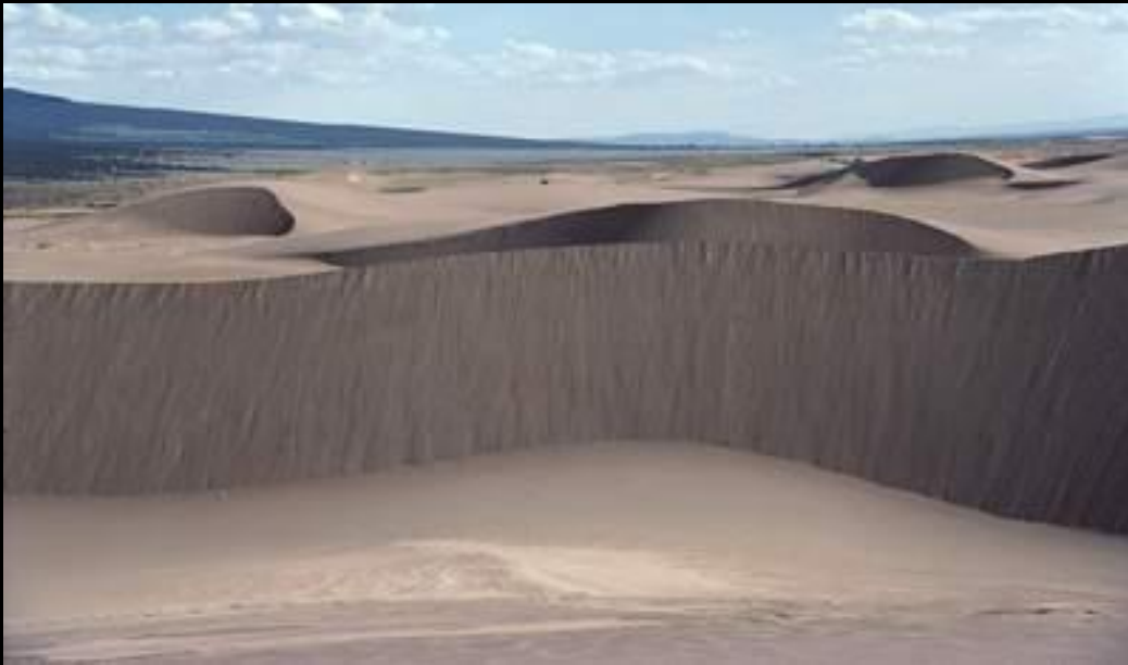
This one can swallow you