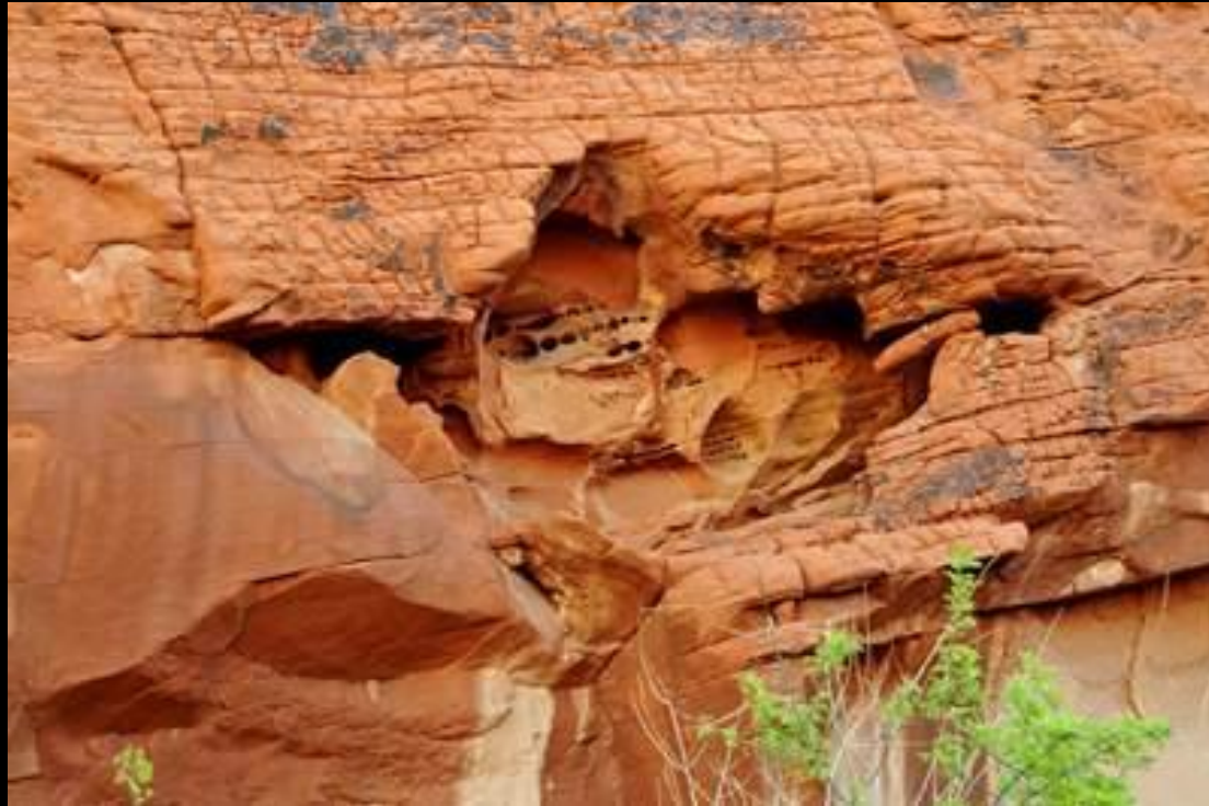
Delicate carving of the soft sandstone by wind and water