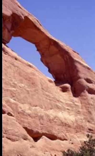
Over thousands of years the hole enlarges, forming a natural bridge