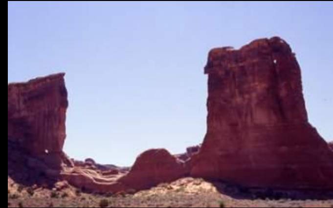
The bridge gets too thin and finally collapses