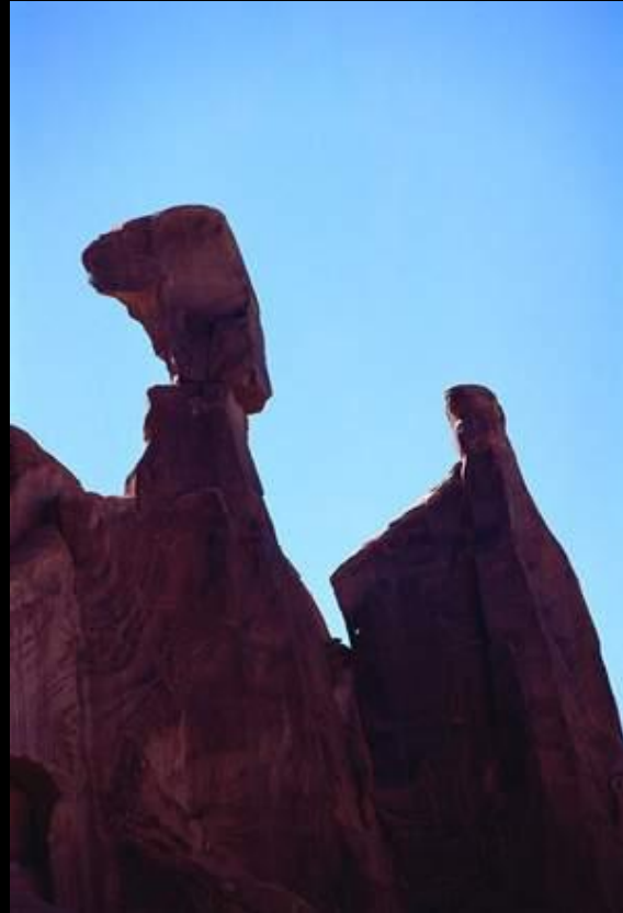
Pharaoh talking to a veiled woman