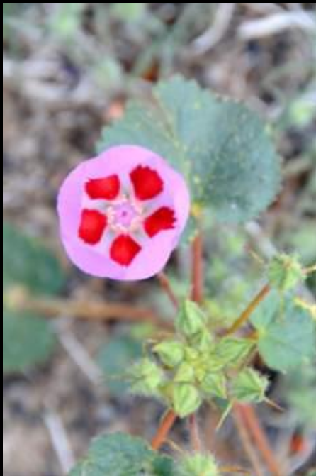
Desert 5 spots