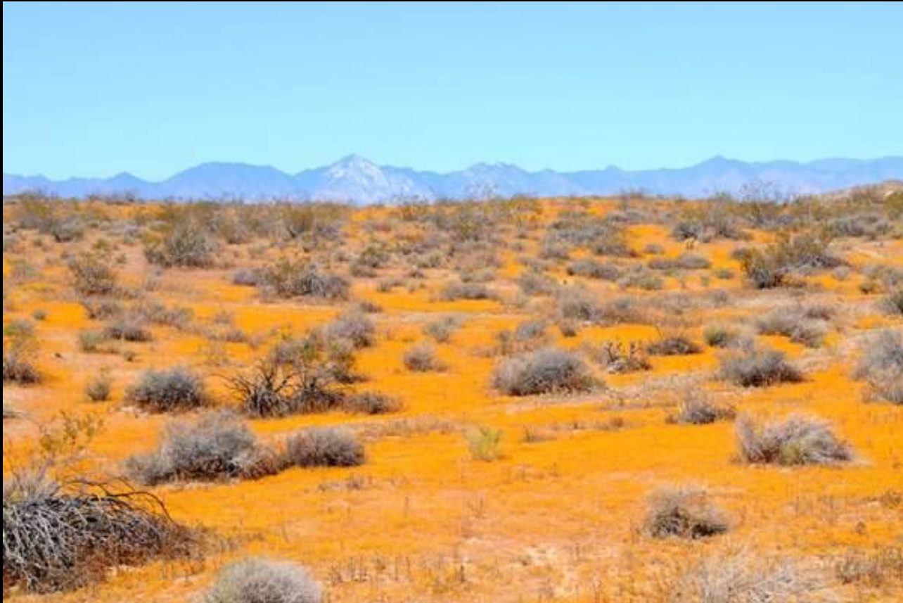
Spring wildflower blossom forms a yellow carpet in Death Valley