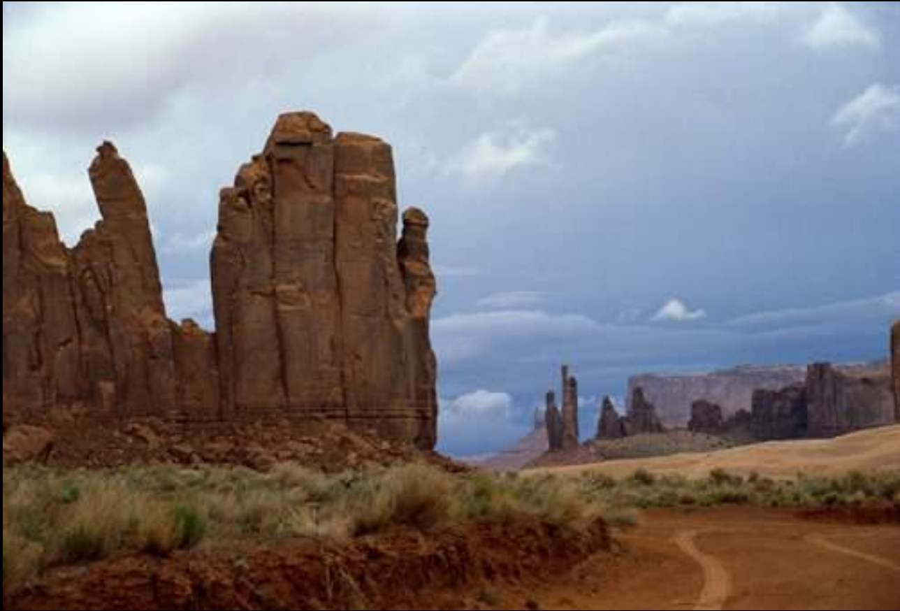
King Kong's hand