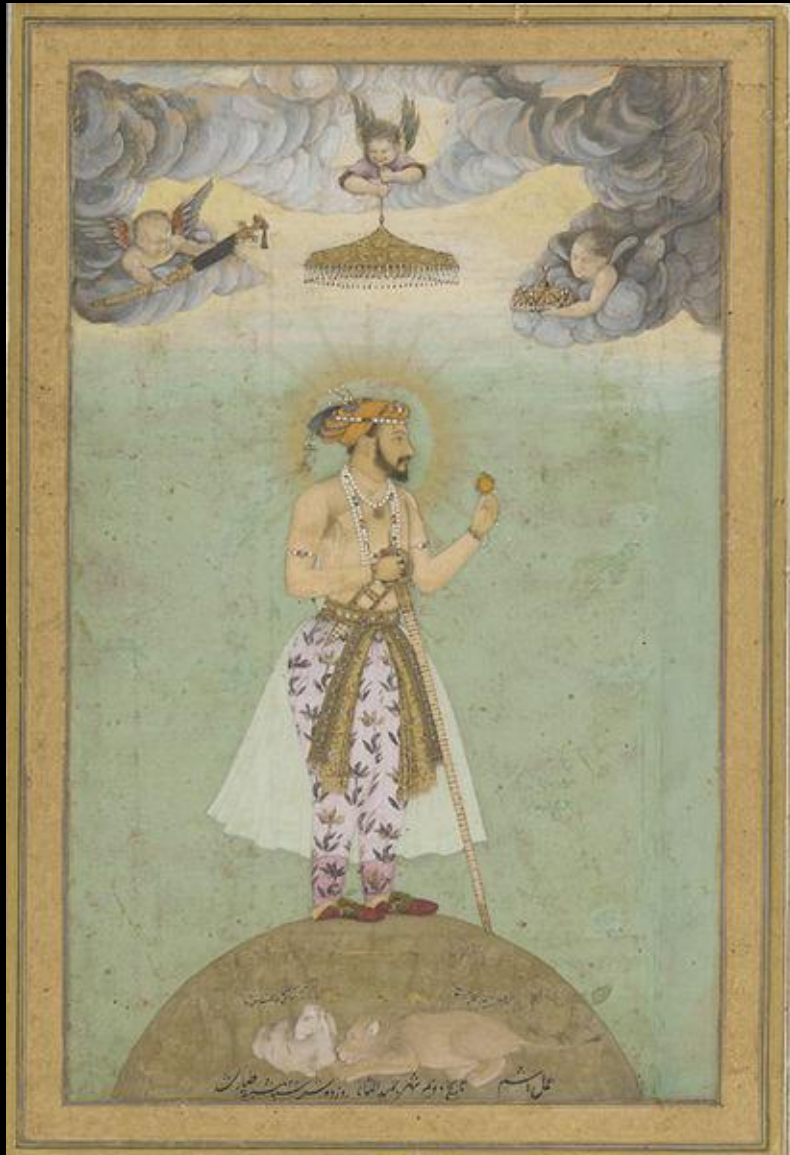
Emperor Shah Jahan